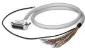
The figure shows the 25-pos. version

Shielded cable with a 15-pos. D-SUB female connector and one open end. The individual wires are labeled 1 to 15 and fitted with ferrules. The braided shield is routed to a separate cable end. Cable length: 1 m.