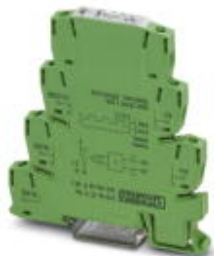
Timer relay with flasher function (beginning with pulse) and an adjustable time range (3 s - 300 s), with screw connection

Please be informed that the data shown in this PDF Document is generated from our Online Catalog. Please find the complete data in the user's documentation. Our General Terms of Use for Downloads are valid ( http://phoenixcontact.com/download )