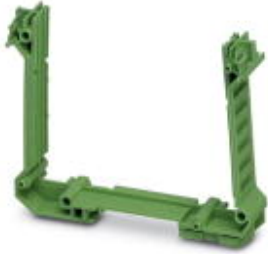
Component housing, Lower part, Color: green, Width: 17.5 mm, Number of positions cross connector: not relevant

Please be informed that the data shown in this PDF Document is generated from our Online Catalog. Please find the complete data in the user's documentation. Our General Terms of Use for Downloads are valid ( http://phoenixcontact.com/download )