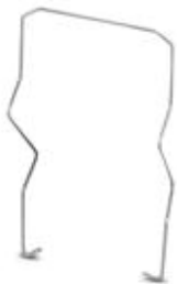
Relay retaining bracket, wire model, suitable for RIF-4 relay base

Please be informed that the data shown in this PDF Document is generated from our Online Catalog. Please find the complete data in the user's documentation. Our General Terms of Use for Downloads are valid ( http://phoenixcontact.com/download )