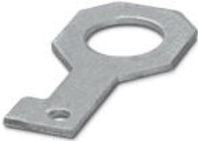
Plate for fixing the FLT-ISG-100-EX isolating spark gap to a flange, drill hole diameter of 42 mm.

Please be informed that the data shown in this PDF Document is generated from our Online Catalog. Please find the complete data in the user's documentation. Our General Terms of Use for Downloads are valid ( http://phoenixcontact.com/download )