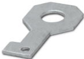
Plate for fixing the FLT-ISG-100-EX isolating spark gap to a flange, drill hole diameter of 30 mm.

Please be informed that the data shown in this PDF Document is generated from our Online Catalog. Please find the complete data in the user's documentation. Our General Terms of Use for Downloads are valid ( http://phoenixcontact.com/download )