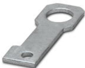
Plate for fixing the FLT-ISG-100-EX isolating spark gap to a flange, drill hole diameter of 26 mm.

Please be informed that the data shown in this PDF Document is generated from our Online Catalog. Please find the complete data in the user's documentation. Our General Terms of Use for Downloads are valid ( http://phoenixcontact.com/download )