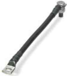
Connecting cable for FLT-ISG-100-EX, length 200 mm.

Please be informed that the data shown in this PDF Document is generated from our Online Catalog. Please find the complete data in the user's documentation. Our General Terms of Use for Downloads are valid ( http://phoenixcontact.com/download )