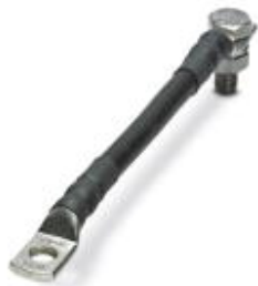
Connecting cable for FLT-ISG-100-EX, length 100 mm.

Please be informed that the data shown in this PDF Document is generated from our Online Catalog. Please find the complete data in the user's documentation. Our General Terms of Use for Downloads are valid ( http://phoenixcontact.com/download )