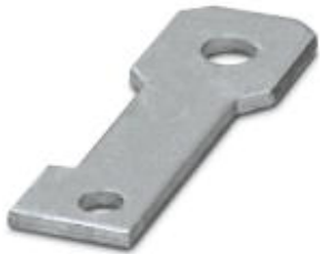
Plate for fixing the FLT-ISG-100-EX isolating spark gap to a flange, drill hole diameter of 14 mm.

Please be informed that the data shown in this PDF Document is generated from our Online Catalog. Please find the complete data in the user's documentation. Our General Terms of Use for Downloads are valid ( http://phoenixcontact.com/download )