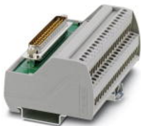
VARIOFACE module, with push-in connection and plug D-SUB miniature pin strip, for mounting on NS 35 rails, 37-pos.

Please be informed that the data shown in this PDF Document is generated from our Online Catalog. Please find the complete data in the user's documentation. Our General Terms of Use for Downloads are valid ( http://phoenixcontact.com/download )