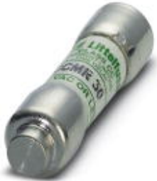
Safety fuse inserts 10 x 38, 30 A.

Please be informed that the data shown in this PDF Document is generated from our Online Catalog. Please find the complete data in the user's documentation. Our General Terms of Use for Downloads are valid ( http://phoenixcontact.com/download )