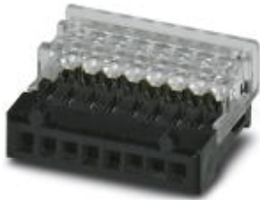
SmartWire DT™ flat plug, 8-pos.

Please be informed that the data shown in this PDF Document is generated from our Online Catalog. Please find the complete data in the user's documentation. Our General Terms of Use for Downloads are valid ( http://phoenixcontact.com/download )