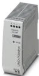
Primary-switched UNO POWER power supply for DIN rail mounting, input: 1-phase, output: 12 V DC/55 W

Please be informed that the data shown in this PDF Document is generated from our Online Catalog. Please find the complete data in the user's documentation. Our General Terms of Use for Downloads are valid ( http://phoenixcontact.com/download )