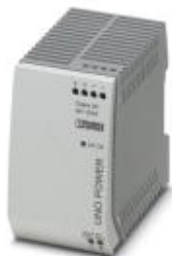
Primary-switched UNO POWER power supply for DIN rail mounting, input: 1-phase, output: 24 V DC/100 W

Please be informed that the data shown in this PDF Document is generated from our Online Catalog. Please find the complete data in the user's documentation. Our General Terms of Use for Downloads are valid ( http://phoenixcontact.com/download )