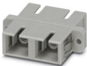
Coupling, SC duplex/SC duplex, compatible with multi-mode and single mode glass fibers, PCF, and polymer fibers

Please be informed that the data shown in this PDF Document is generated from our Online Catalog. Please find the complete data in the user's documentation. Our General Terms of Use for Downloads are valid ( http://phoenixcontact.com/download )