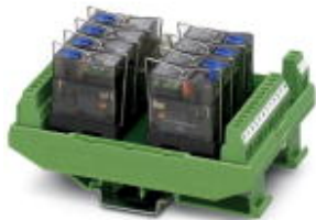
VARIOFACE output module, with 8 miniature relays, 1 PDT with detectable manual operation each, plugged, for 24 V DC (incl. relay)

Please be informed that the data shown in this PDF Document is generated from our Online Catalog. Please find the complete data in the user's documentation. Our General Terms of Use for Downloads are valid ( http://phoenixcontact.com/download )