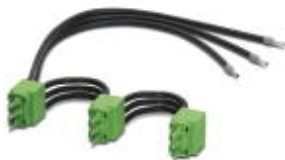
Figure shows variant for 3 modules

3-phase loop bridge for 2 CONTACTRON modules, with screw connection and 22.5 mm housing width, connecting cable: 0.3 m, with ferrules.