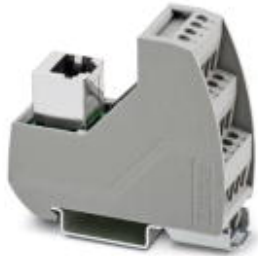
VARIOFACE module with screw connection and RJ45 connector

Please be informed that the data shown in this PDF Document is generated from our Online Catalog. Please find the complete data in the user's documentation. Our General Terms of Use for Downloads are valid ( http://phoenixcontact.com/download )