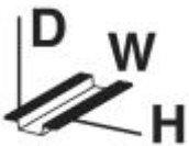
Figure shows PLC-BSC-120UC/21-21/SO46 version

14 mm PLC basic terminal block for high switch-on currents with push-in connection, without relay or solid-state relay, for mounting on DIN rail NS 35/7,5, with load return line connection (BB), 1 N/O contact, input voltage 24 V DC