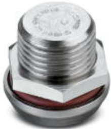
Plug, M20, for FB... enclosure

Please be informed that the data shown in this PDF Document is generated from our Online Catalog. Please find the complete data in the user's documentation. Our General Terms of Use for Downloads are valid ( http://phoenixcontact.com/download )