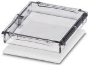
Installation component housing, Housing cover, Cross connection: Component housing, Color: transparent, Width: 53.6 mm

Please be informed that the data shown in this PDF Document is generated from our Online Catalog. Please find the complete data in the user's documentation. Our General Terms of Use for Downloads are valid ( http://phoenixcontact.com/download )