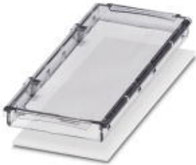
Installation component housing, Housing cover, Color: transparent, Width: 107.6 mm

Please be informed that the data shown in this PDF Document is generated from our Online Catalog. Please find the complete data in the user's documentation. Our General Terms of Use for Downloads are valid ( http://phoenixcontact.com/download )