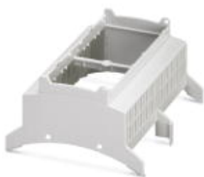
Installation component housing, Upper part, Cross connection: Component housing, Color: light gray, Width: 107.6 mm, Constructional height: 62.2 mm

Please be informed that the data shown in this PDF Document is generated from our Online Catalog. Please find the complete data in the user's documentation. Our General Terms of Use for Downloads are valid ( http://phoenixcontact.com/download )