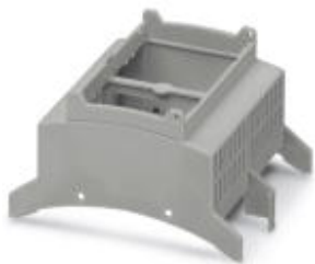
Installation component housing, Upper part, Color: light gray, Width: 71.6 mm, Constructional height: 62.2 mm

Please be informed that the data shown in this PDF Document is generated from our Online Catalog. Please find the complete data in the user's documentation. Our General Terms of Use for Downloads are valid ( http://phoenixcontact.com/download )