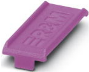
Color marking for FL PATCH GUARD, purple

Please be informed that the data shown in this PDF Document is generated from our Online Catalog. Please find the complete data in the user's documentation. Our General Terms of Use for Downloads are valid ( http://phoenixcontact.com/download )