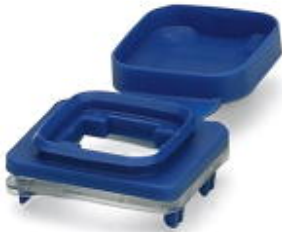
IP54 protection with color marking for SFN switch and angled patch connector, blue

Please be informed that the data shown in this PDF Document is generated from our Online Catalog. Please find the complete data in the user's documentation. Our General Terms of Use for Downloads are valid ( http://phoenixcontact.com/download )