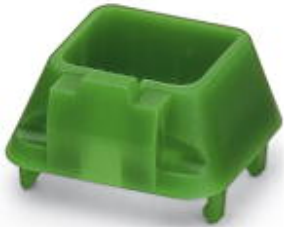
Security frame for SFN switch and patch fields, green

Please be informed that the data shown in this PDF Document is generated from our Online Catalog. Please find the complete data in the user's documentation. Our General Terms of Use for Downloads are valid ( http://phoenixcontact.com/download )