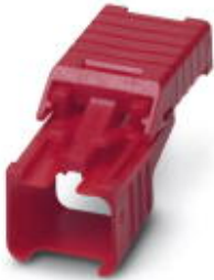
Lockable security element

Please be informed that the data shown in this PDF Document is generated from our Online Catalog. Please find the complete data in the user's documentation. Our General Terms of Use for Downloads are valid ( http://phoenixcontact.com/download )