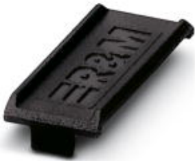
Color marking for FL PATCH GUARD, black

Please be informed that the data shown in this PDF Document is generated from our Online Catalog. Please find the complete data in the user's documentation. Our General Terms of Use for Downloads are valid ( http://phoenixcontact.com/download )