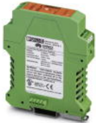
Digital extension module with 2 digital inputs for measuring pulses and frequencies

Please be informed that the data shown in this PDF Document is generated from our Online Catalog. Please find the complete data in the user's documentation. Our General Terms of Use for Downloads are valid ( http://phoenixcontact.com/download )