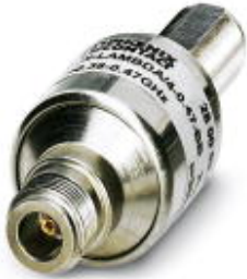
Attachment plug with Lambda/4 technology as surge protection for coaxial signal interfaces. Connection: N connectors socket-socket

Please be informed that the data shown in this PDF Document is generated from our Online Catalog. Please find the complete data in the user's documentation. Our General Terms of Use for Downloads are valid ( http://phoenixcontact.com/download )