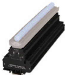
TERMITRAB base element with universal foot, with screw connections on both sides.

Please be informed that the data shown in this PDF Document is generated from our Online Catalog. Please find the complete data in the user's documentation. Our General Terms of Use for Downloads are valid ( http://phoenixcontact.com/download )