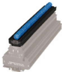
Protective plug with varistor for TERMITRAB base element TT-UKK5-T-BE, nominal voltage: 24 V DC

Please be informed that the data shown in this PDF Document is generated from our Online Catalog. Please find the complete data in the user's documentation. Our General Terms of Use for Downloads are valid ( http://phoenixcontact.com/download )