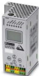
AS-Interface (AS-i)-Gateway for PROFIBUS DP with extended function, double master, IP20 degree of protection, as per AS-i specification 3.0

Please be informed that the data shown in this PDF Document is generated from our Online Catalog. Please find the complete data in the user's documentation. Our General Terms of Use for Downloads are valid ( http://phoenixcontact.com/download )