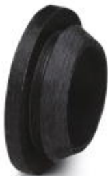
Cable bush for assembly troughs, for protection of the lines guided through the laminated frame

Please be informed that the data shown in this PDF Document is generated from our Online Catalog. Please find the complete data in the user's documentation. Our General Terms of Use for Downloads are valid ( http://phoenixcontact.com/download )