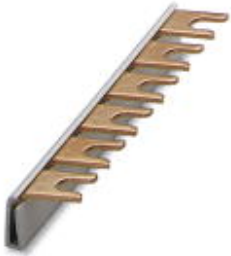
Wiring bridge for modules with connecting pitch 17.5 mm, 1-phase, 9-pos.

Please be informed that the data shown in this PDF Document is generated from our Online Catalog. Please find the complete data in the user's documentation. Our General Terms of Use for Downloads are valid ( http://phoenixcontact.com/download )