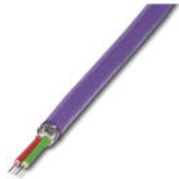
PROFIBUS cable, Fast Connect type, up to 12 Mbps (02YSY (ST)CY 1x2x22 AWG)

Please be informed that the data shown in this PDF Document is generated from our Online Catalog. Please find the complete data in the user's documentation. Our General Terms of Use for Downloads are valid ( http://phoenixcontact.com/download )