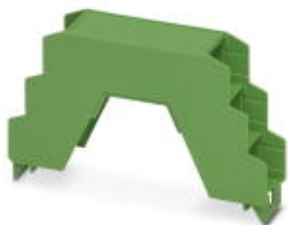
Component housing, Upper part, Color: green, Width: 22.5 mm, Constructional height: 51.5 mm

Please be informed that the data shown in this PDF Document is generated from our Online Catalog. Please find the complete data in the user's documentation. Our General Terms of Use for Downloads are valid ( http://phoenixcontact.com/download )