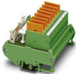
Fuse module with LEDs (for digital input cards of the Delta V control system)

Please be informed that the data shown in this PDF Document is generated from our Online Catalog. Please find the complete data in the user's documentation. Our General Terms of Use for Downloads are valid ( http://phoenixcontact.com/download )