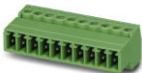
The figure shows a 10-position version of the product

Plug component, Nominal current: 8 A, Rated voltage (III/2): 160 V, Number of positions: 10, Pitch: 3.81 mm, Connection method: Screw connection with tension sleeve, Color: green, Contact surface: Gold