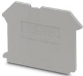
End cover, Length: 50 mm, Width: 2 mm, Height: 36 mm, Color: gray

Please be informed that the data shown in this PDF Document is generated from our Online Catalog. Please find the complete data in the user's documentation. Our General Terms of Use for Downloads are valid ( http://phoenixcontact.com/download )