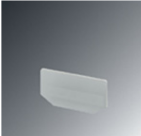
End cover, Length: 68 mm, Width: 2.2 mm, Color: gray

Please be informed that the data shown in this PDF Document is generated from our Online Catalog. Please find the complete data in the user's documentation. Our General Terms of Use for Downloads are valid ( http://phoenixcontact.com/download )