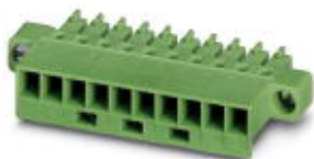
The illustration shows a 16-position version

Plug component, Nominal current: 8 A, Rated voltage (III/2): 160 V, Number of positions: 13, Pitch: 3.81 mm, Connection method: Crimp connection, Color: green, Corresponding female crimp contacts with current [A] and conductor cross section range [mm²] data: 5A/MCC-MT 0,2-0,35 (1859988); 8A/MCC-MT 0,5-1,0 (1859991)