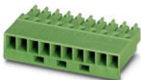
The illustration shows a 16-position version

Plug component, Nominal current: 8 A, Rated voltage (III/2): 160 V, Number of positions: 4, Pitch: 3.81 mm, Connection method: Crimp connection, Color: green, Corresponding female crimp contacts with current [A] and conductor cross section range [mm²] data: 5A/MCC-MT 0,2-0,35 (1859988); 8A/MCC-MT 0,5-1,0 (1859991)