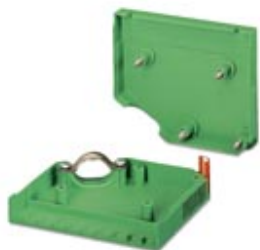
Cable housing, Pitch: 0 mm, Number of positions: 11, Dimension a: 85.62 mm, Color: green

Please be informed that the data shown in this PDF Document is generated from our Online Catalog. Please find the complete data in the user's documentation. Our General Terms of Use for Downloads are valid ( http://phoenixcontact.com/download )