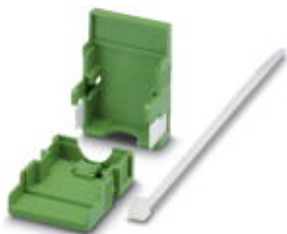
Cable housing, Pitch: 3.81 mm, Number of positions: 2, Dimension a: 10.01 mm, Color: green

Please be informed that the data shown in this PDF Document is generated from our Online Catalog. Please find the complete data in the user's documentation. Our General Terms of Use for Downloads are valid ( http://phoenixcontact.com/download )