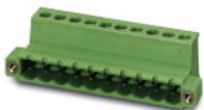
The figure shows a 10-position version of the product

Plug component, Nominal current: 12 A, Rated voltage (III/2): 320 V, Number of positions: 5, Pitch: 5.08 mm, Connection method: Screw connection with tension sleeve, Color: green, Contact surface: Tin