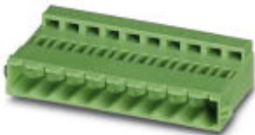
The illustration shows an 10-position version

Plug component, Nominal current: 12 A, Rated voltage (III/2): 320 V, Number of positions: 11, Pitch: 5.08 mm, Connection method: Crimp connection, Color: green, Corresponding male crimp contacts with current [A] and conductor cross section range [mm 2 ] data: 10A/ICC-MT 0,5-1,0 (3190577); 10A/ICC-MT 0,5-1,0 BA (3190603); 12A/ICC-MT 1,5-2,5 (3190580); 12A/ICC-MT 1,5-2,5 BA (3190593). BA = Bandkontakte