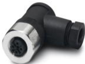
Sensor/actuator connector, female, angled, 5-pos., M12, screw connection, high-grade steel knurl, cable screw connection Pg7

Please be informed that the data shown in this PDF Document is generated from our Online Catalog. Please find the complete data in the user's documentation. Our General Terms of Use for Downloads are valid ( http://phoenixcontact.com/download )